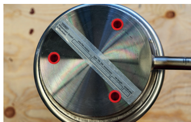
The expansion joints are fastened on a special retaining plate by means of three threaded blind holes