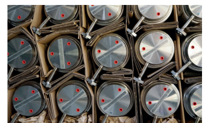
The replacement after 30 years – Quality by Witzenmann is ready for shipping