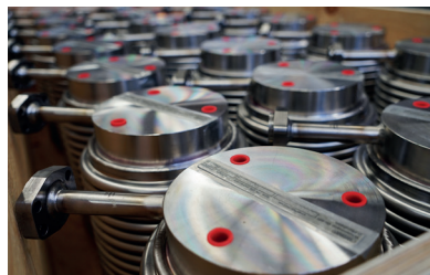
First delivery of the 750 flexible Hydra® hydraulic expansion joints