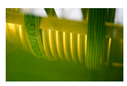
Pressure and leakproof testing in special liquid bath