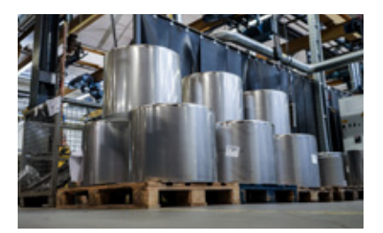
After all tests, monitorings and checks during production, the construction elements are washed with 100% chemically pure water before they are shrink-wrapped in halogenide-free film